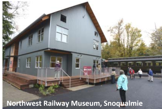
Northwest Railway Museum, Snoqualmie