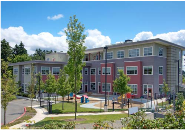
Angle Lake Family Resource Center