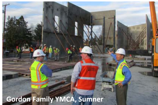
Gordon Family YMCA, Sumner