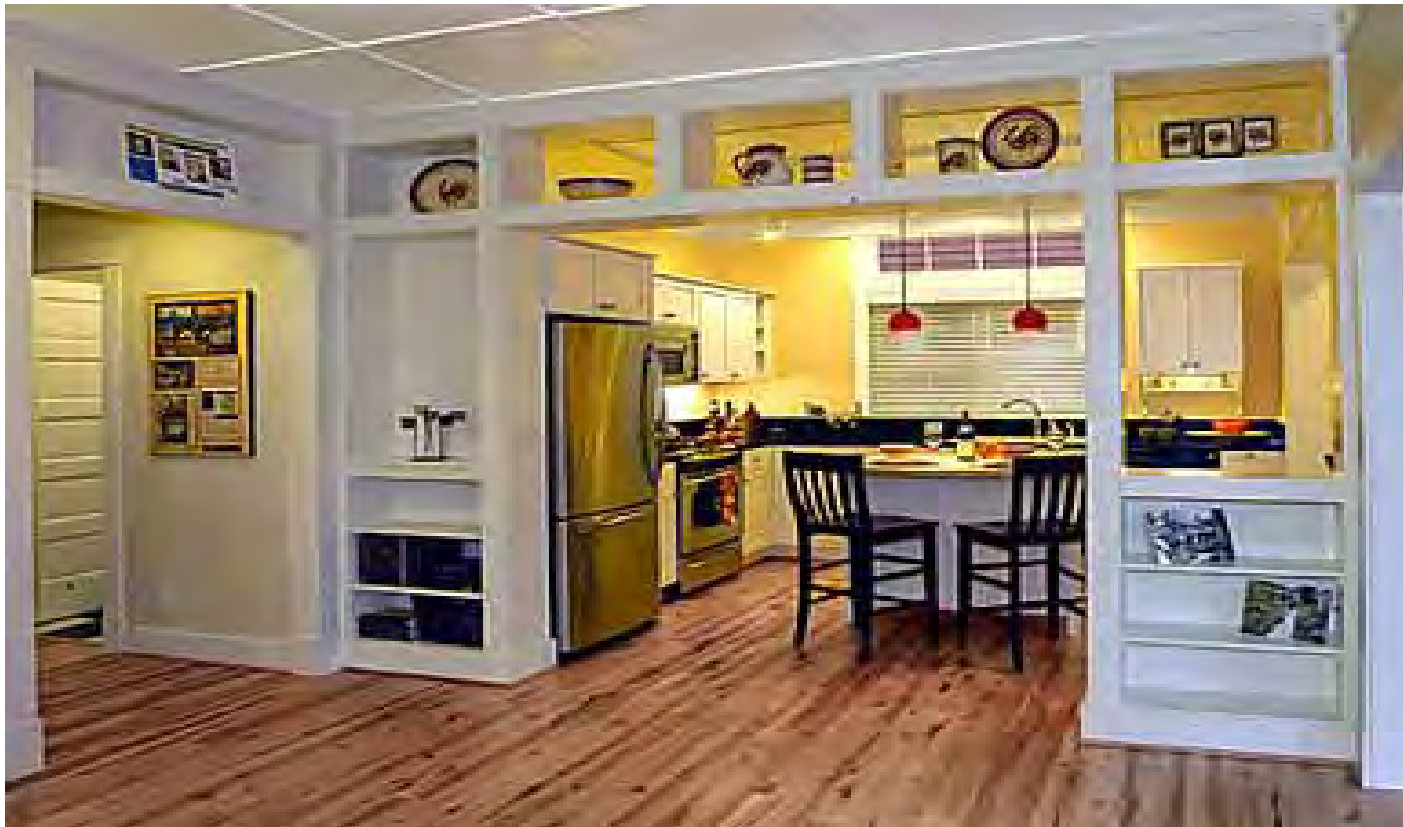
"CHANGE" Housing Washington Affordable Housing Conference 2009