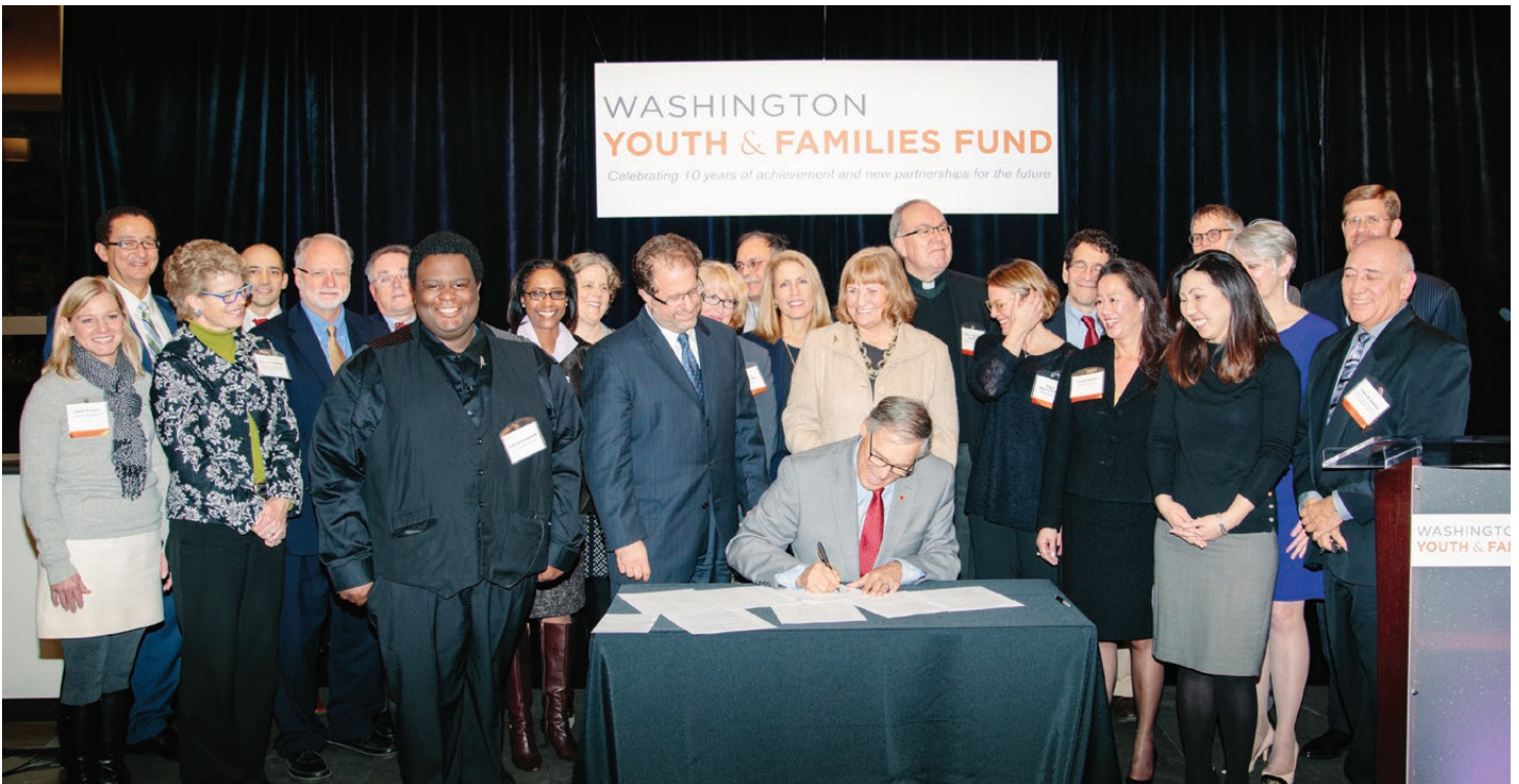
Joined by public and private sector partners, Governor Jay Inslee signed WYFF's new Memorandum of Understanding in December 2014.