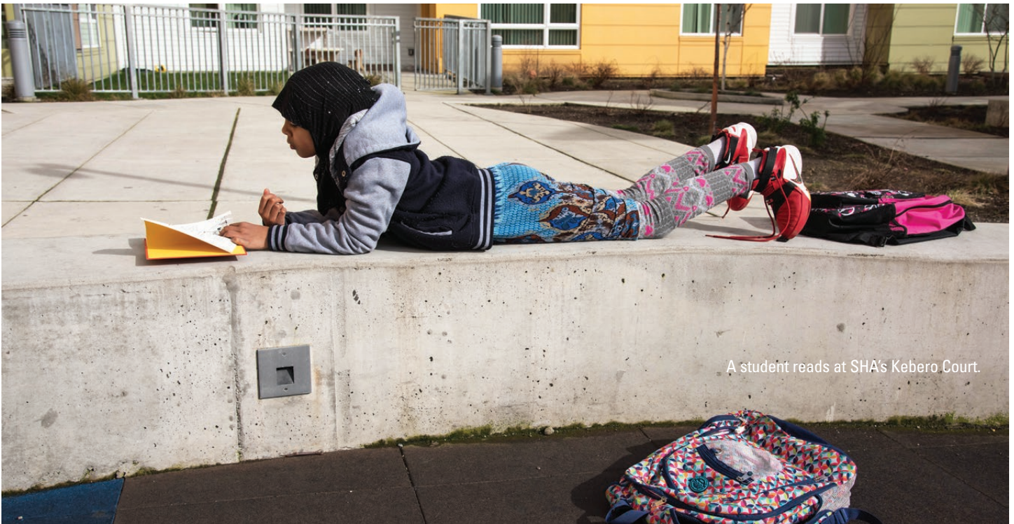
A student reads at SHA's Kebero Court.

system and create a college-aspiring culture at home.